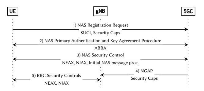
Figure 1: Simplified security context establishment between UE and 5GC core network in 5G SA.

Responsible Disclosure. At the time of submission, we started the responsible disclosure process through the GSMA CVD program [14]. We further notified manufacturers about implementation flaws to contribute to timely fixes.